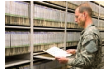
Records Management Solutions Consolidate medical records and sensitive documents in central, supervised areas close to the point of need. Controlled access allows you to increase accountability and better manage your files.