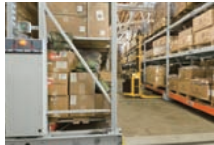
High-Density S6 Industrial Mobile Storage Systems From blankets, boots, coats and cots, to parachutes, life vests, inflatable life boats and emergency medical kits, our High-Density S6 Industrial Mobile Storage Systems let you warehouse bulky items in half the space of conventional storage options, with secure access control.

Assurance that supplies will be there when you need them. Adaptability to changing equipment. Logistics and supply operations encompass the most vast storage needs in any military branch. And demand solutions every bit as broad and varied.