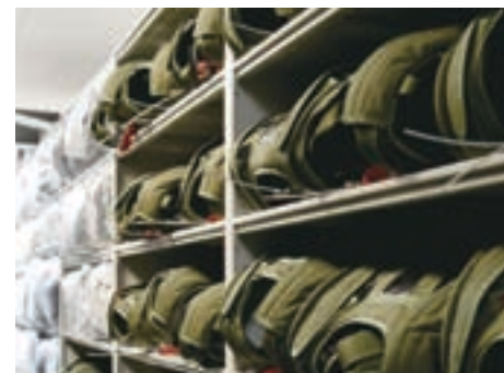
High-Density Mobile Storage for parajumpers