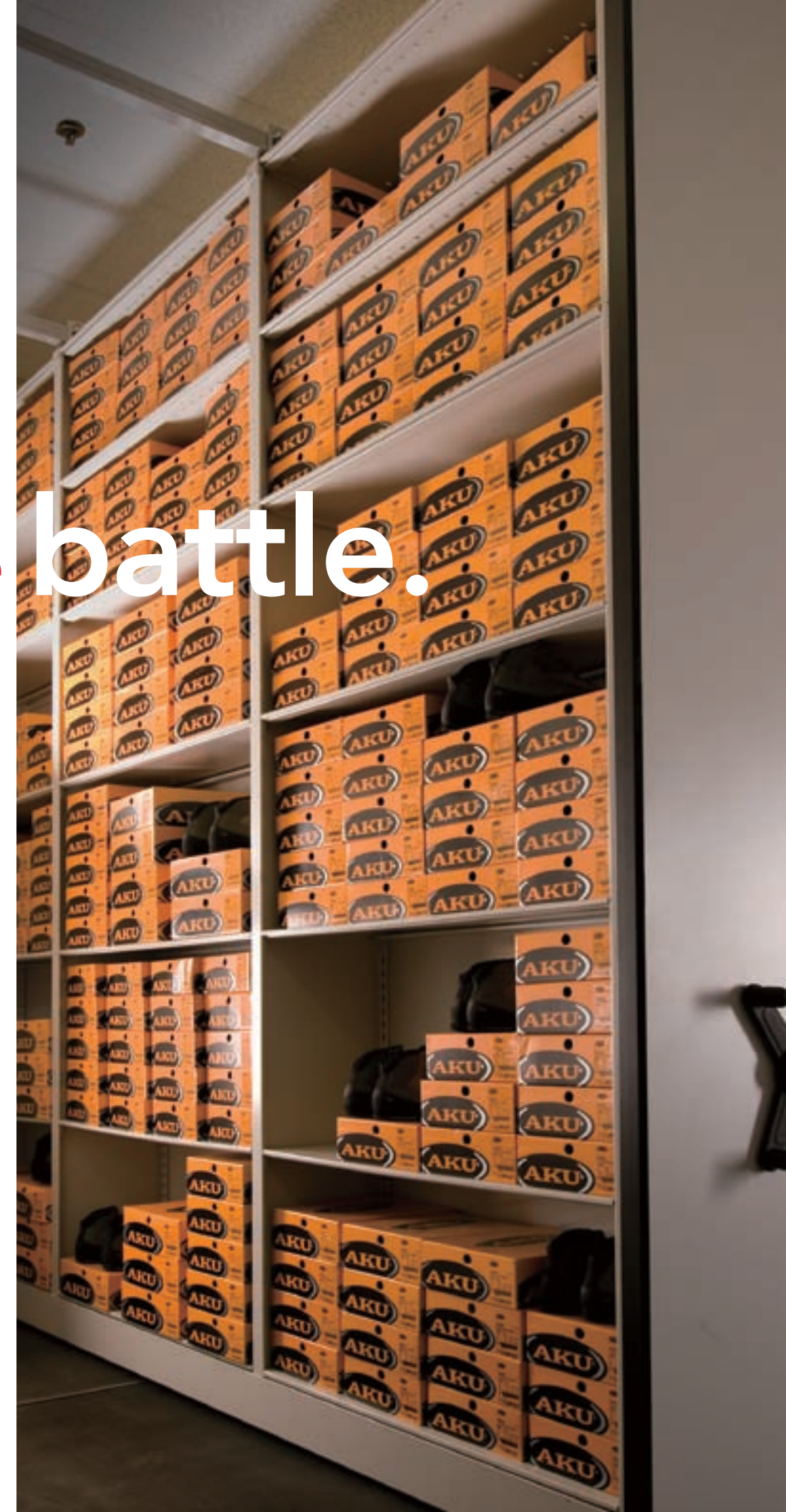
Mechanical-Assist High-Density Mobile Storage Systems Easily moved to provide quick access to the desired aisle, our Mechanical-Assist High-Density Mobile Storage Systems maximize your storage space.

In your maintenance areas, tools, parts, bench stock, equipment and manuals can be kept close at hand to help increase efficiency in repairing, rebuilding and upgrading vehicles, equipment and facilities.