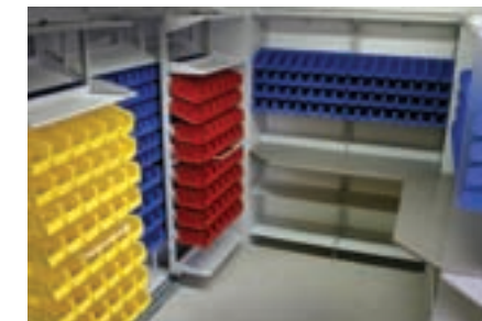
FrameWRX™ Storage Systems The most adaptable healthcare storage system available, our highly modular, fully flexible FrameWRX™ Storage System is perfect for providing highly customizable storage in any area of your military hospital or clinic.