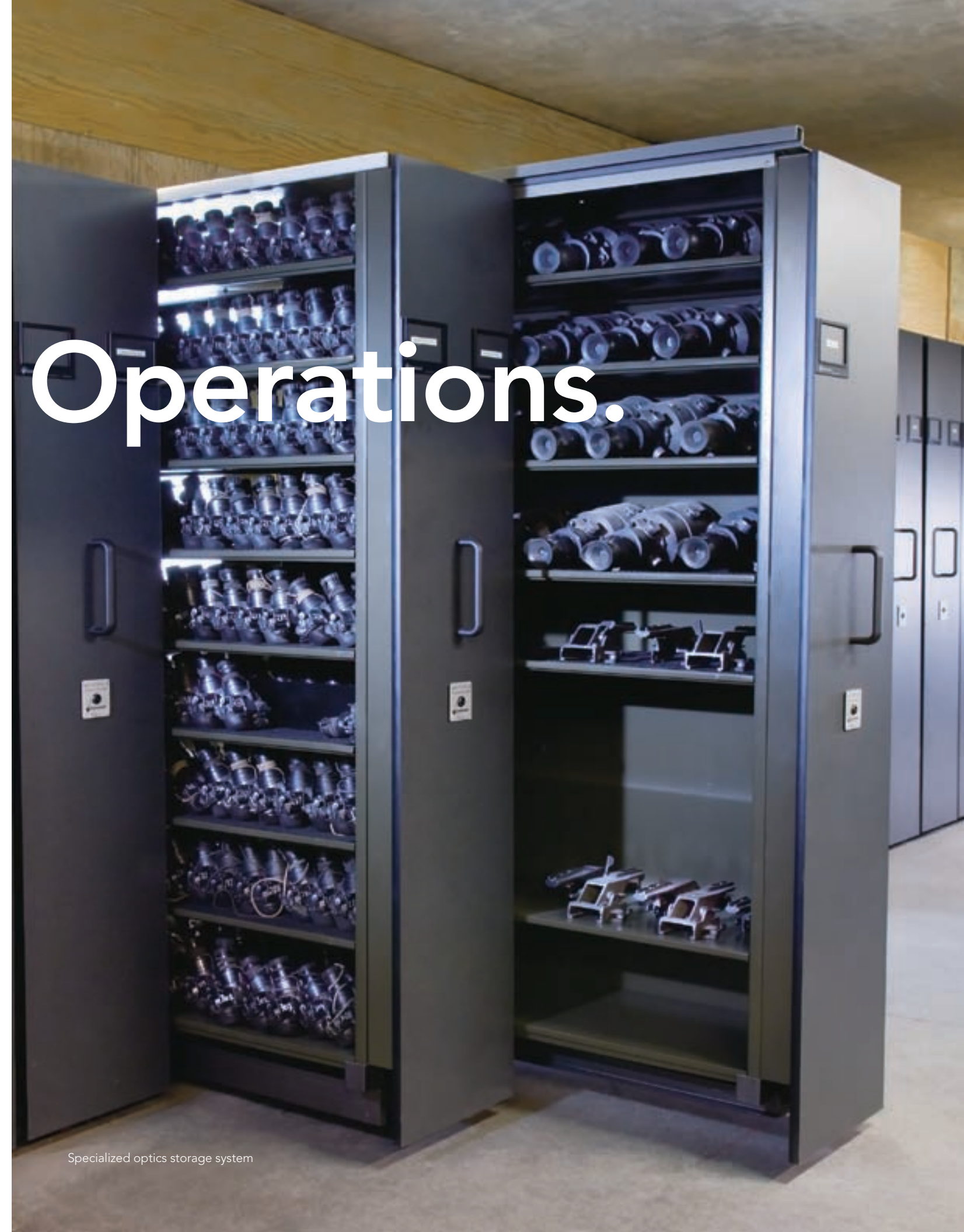
Specialized optics storage system