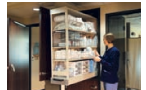
In-Room Patient Storage System Restock medical supplies in the hallway, then conveniently access them inside the room when needed for the patient. Our In-Room Patient Storage System can help reduce the number of in-room intrusions and interruptions, which can increase the potential spread of germs and the transfer of hospital-acquired infections.