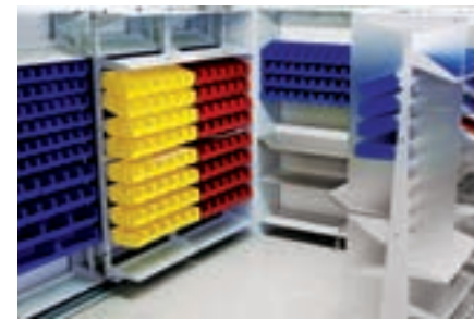
FrameWRX™ Storage System With the flexibility to adapt to changing needs quickly and easily, our modular FrameWRX™ Storage System provides highly customizable storage. Hang bins, trays and pegs on its innovative rail system to maximize storage of tools and parts and optimize workspace.